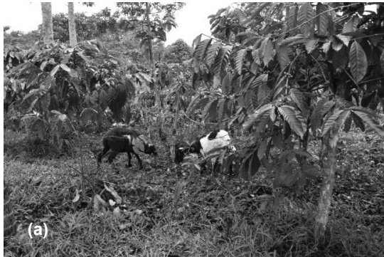
Figure 2. Demonstration plots established in Indonesia

Note: Integration of rubber, coffee, and macadamia