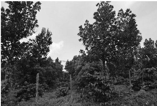
Figure 6. CCA strategy showcased in the Central Highlands of Vietnam

Notes: (a) Aqua-silviculture (b) Goat production