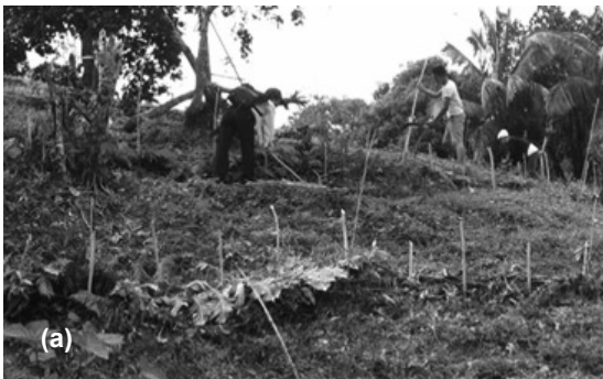
Figure 4. CCA strategies showcased in the study sites in the Philippines