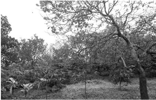
Figure 1. Demonstration plots established in Vietnam