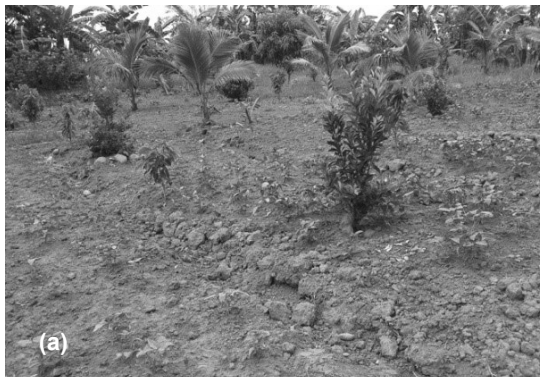
Figure 3. Demonstration plots established in the Philippines

Notes: (a) Agrisilvipasture system of agroforestry (b) Agrisilvi system of agroforestry