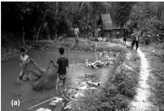
Figure 5. CCA strategies showcased in the Indonesia study sites

Notes: (a) Establishment of contour hedgerows (b) Construction of rainwater harvesting facility